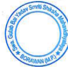
Surmali Narve Co-Convener